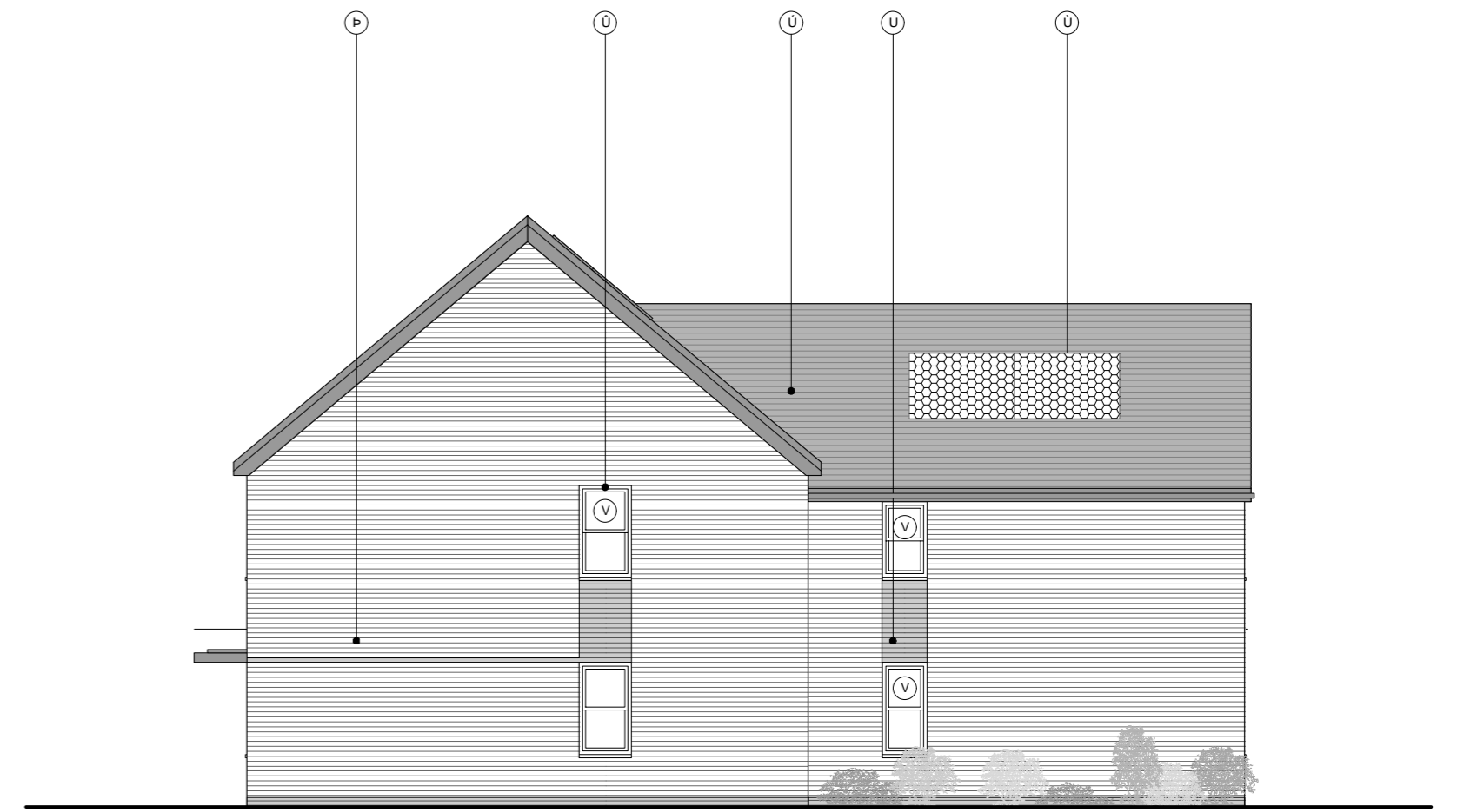
○ EAST ELEVATION PPTM