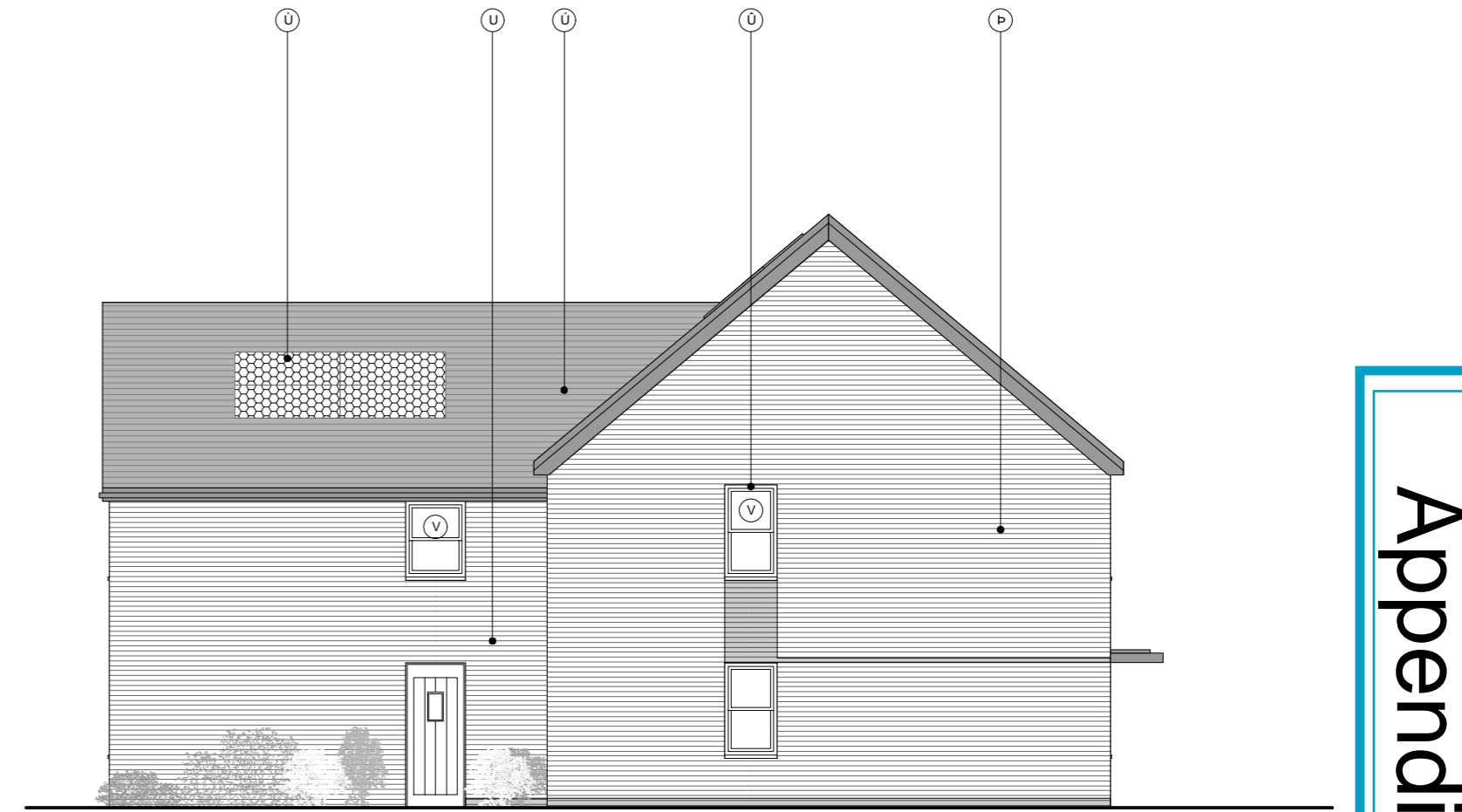
○ WEST ELEVATION PPTM