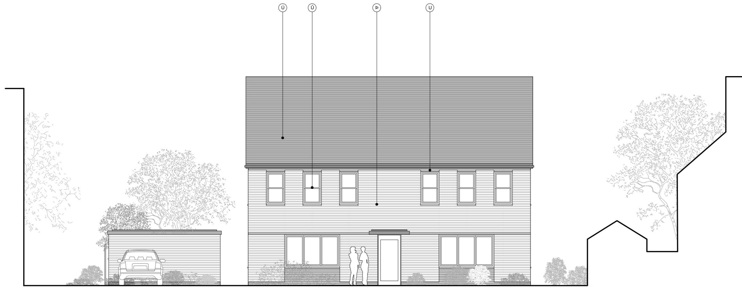
○ SOUTH ELEVATION PPTM