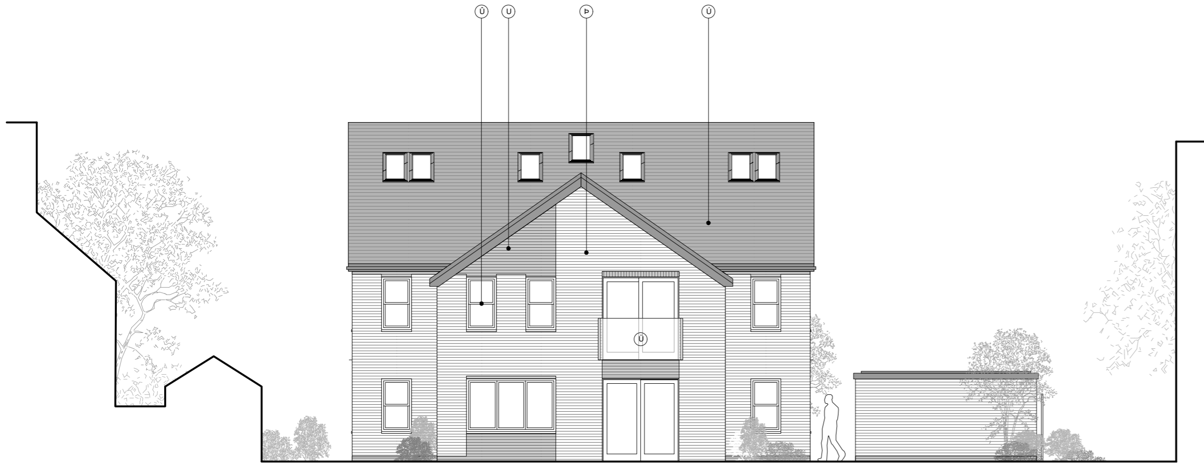
○ NORTH ELEVATION PPTM